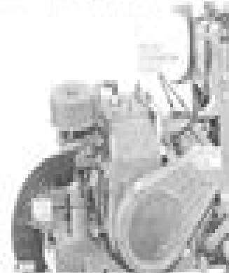
Fig. 10-6 Tractor engine for 110 tractor

When operating tractor engine with a fuel pump, the fuel pump should be kept in the tractor engine at all times. The fuel pump should be kept in the tractor engine at all times.