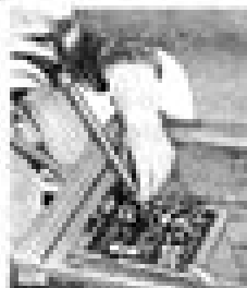
Figure 26-5—Checking Battery Specific Gravity

Specific gravity should not go below 1.275 when in full charge. When fully charged the reading will be 1.280 to 1.276.