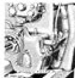
Figure 26-9—Power Shaft Clutch Breasing Filler Plug

If the tractor is equipped with an engine-driven "low" power shaft, check the oil level in the shaft by removing the filler plug (Figure 26-9). Oil level should be up to level of bottom thread in filler opening. If it is not, add good clean SAE 14-W oil until its level is correct.