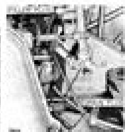
Cranking Engine Transmission Oil Plug