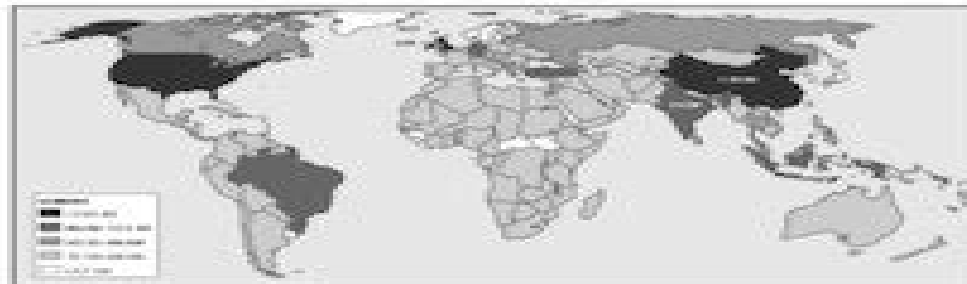
Figure 2.1 Air transport passengers carried by country, 2015