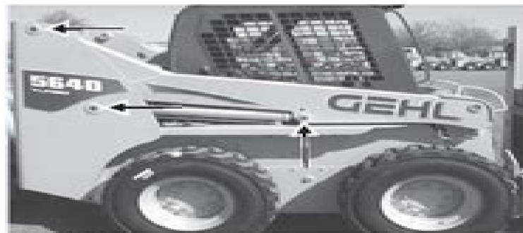
Fig. 3-10 Grease fitting locations.