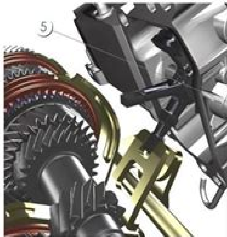
Système S-Com S-Com system