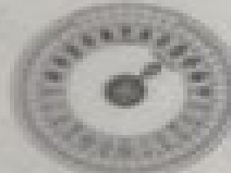
Figure 1 shows the switch in the "ON" position. The switch will be energized when the switch is plugged into the main electrical outlet.

NOTE: The switch is not to be used as a power source. The switch will be energized when the switch is plugged into the main electrical outlet. The switch will be de-energized when the switch is plugged into the main electrical outlet.