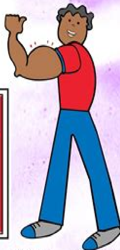
Muscle Man - Powerful Verbs