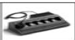
Multi-unit Charger MUTV4004