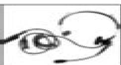
Light Weight Head Set MUTV4001