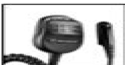
Remote Speaker Microphone MUTV4006