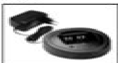
Rapid-rate Desktop Charger MUTV4005