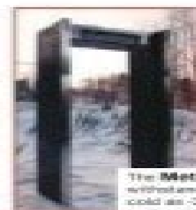
The Meteor 200 WP can withstand temperatures as cold as -30 °C (-22 °F) with optional heater.

All parameters are set through a remote control unit that utilizes passwords to eliminate unauthorized personnel to control the gate. The alphanumeric display on the remote control shows the results of the self-testing diagnostics, traffic counting, and parameter adjustment.