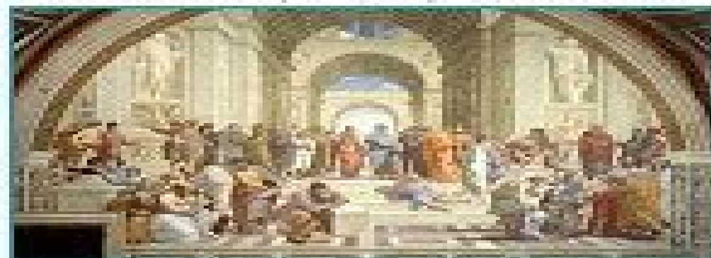
The School of Athens, by Raphael, various philosophers of classical antiquity gathered in one place, with Plato and Aristotle at the center. Raphael modeled Plato after Leonardo da Vinci.

Renaissance artists sought to imitate and surpass the masterpieces of painting. They developed a sense of realism that had not been seen in medieval art by portraying human subjects with realistic proportions. They also employed new techniques, such as linear perspective , which made two-dimensional works of art appear three-dimensional. Renaissance art was heavily influenced by humanistic studies, as evidenced by the prevalence of Greek, Roman, and biblical figures in paintings, sculpture, and architecture.