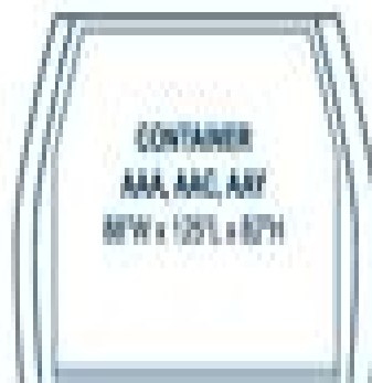
Position 1 - 10