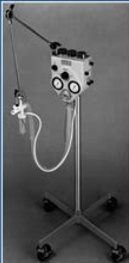
Copyright © 1999, 1995, 1990, 1985, 1980, 1975, 1970, 1965, 1960, 1955, 1950, 1945, 1940, 1935, 1930, 1925, 1920, 1915, 1910, 1905, 1900, 1895, 1890, 1885, 1880, 1875, 1870, 1865, 1860, 1855, 1850, 1845, 1840, 1835, 1830, 1825, 1820, 1815, 1810, 1805, 1800, 1795, 1790, 1785, 1780, 1775, 1770, 1765, 1760, 1755, 1750, 1745, 1740, 1735, 1730, 1725, 1720, 1715, 1710, 1705, 1700, 1695, 1690, 1685, 1680, 1675, 1670, 1665, 1660, 1655, 1650, 1645, 1640, 1635, 1630, 1625, 1620, 1615, 1610, 1605, 1600, 1595, 1590, 1585, 1580, 1575, 1570, 1565, 1560, 1555, 1550, 1545, 1540, 1535, 1530, 1525, 1520, 1515, 1510, 1505, 1500, 1495, 1490, 1485, 1480, 1475, 1470, 1465, 1460, 1455, 1450, 1445, 1440, 1435, 1430, 1425, 1420, 1415, 1410, 1405, 1400, 1395, 1390, 1385, 1380, 1375, 1370, 1365, 1360, 1355, 1350, 1345, 1340, 1335, 1330, 1325, 1320, 1315, 1310, 1305, 1300, 1295, 1290, 1285, 1280, 1275, 1270, 1265, 1260, 1255, 1250, 1245, 1240, 1235, 1230, 1225, 1220, 1215, 1210, 1205, 1200, 1195, 1190, 1185, 1180, 1175, 1170, 1165, 1160, 1155, 1150, 1145, 1140, 1135, 1130, 1125, 1120, 1115, 1110, 1105, 1100, 1095, 1090, 1085, 1080, 1075, 1070, 1065, 1060, 1055, 1050, 1045, 1040, 1035, 1030, 1025, 1020, 1015, 1010, 1005, 1000, 995, 990, 985, 980, 975, 970, 965, 960, 955, 950, 945, 940, 935, 930, 925, 920, 915, 910, 905, 900, 895, 890, 885, 880, 875, 870, 865, 860, 855, 850, 845, 840, 835, 830, 825, 820, 815, 810, 805, 800, 795, 790, 785, 780, 775, 770, 765, 760, 755, 750, 745, 740, 735, 730, 725, 720, 715, 710, 705, 700, 695, 690, 685, 680, 675, 670, 665, 660, 655, 650, 645, 640, 635, 630, 625, 620, 615, 610, 605, 600, 595, 590, 585, 580, 575, 570, 565, 560, 555, 550, 545, 540, 535, 530, 525, 520, 515, 510, 505, 500, 495, 490, 485, 480, 475, 470, 465, 460, 455, 450, 445, 440, 435, 430, 425, 420, 415, 410, 405, 400, 395, 390, 385, 380, 375, 370, 365, 360, 355, 350, 345, 340, 335, 330, 325, 320, 315, 310, 305, 300, 295, 290, 285, 280, 275, 270, 265, 260, 255, 250, 245, 240, 235, 230, 225, 220, 215, 210, 205, 200, 195, 190, 185, 180, 175, 170, 165, 160, 155, 150, 145, 140, 135, 130, 125, 120, 115, 110, 105, 100, 95, 90, 85, 80, 75, 70, 65, 60, 55, 50, 45, 40, 35, 30, 25, 20, 15, 10, 5, 0