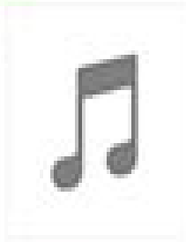
Jessie J, Ariana Grande...