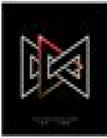
EP. TWO The Eastern Library