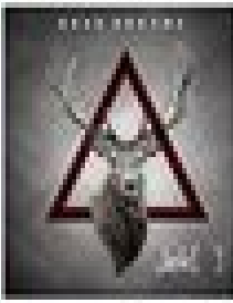
Dear Dreams JIN