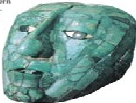
▼ Maya jade death mask, seventh century A.D.

Archaeologists have identified at least 50 major Maya sites, all with monumental architecture. For example, Temple IV pyramid at Tikal stretched 212 feet into the jungle sky. In addition to temples and pyramids, each