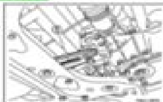
Figure shows A/T models. The shape of the bracket on the transverse side is different for M/T models.