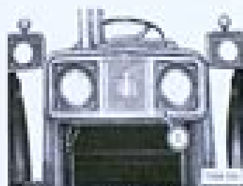
1 - Securing screws

Remove the adjusting screws, taking care not to lose the springs, then withdraw the rubber housing rearward, complete with sealed beam unit from the upper grille. From the rear of the housing, push out the sealed beam unit.