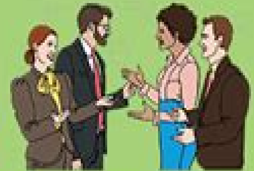
Appropriate Body Language