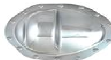
GM 9.5" 14 Bolt