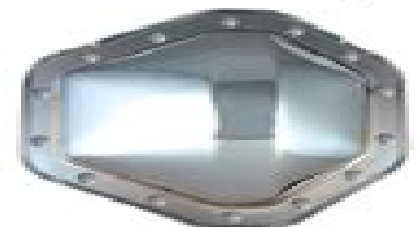
GM 14 Bolt