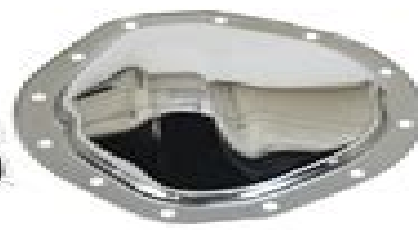
GM 12 Bolt