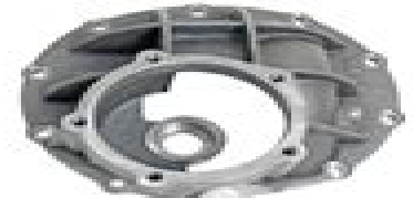
Ford 9 Third Member