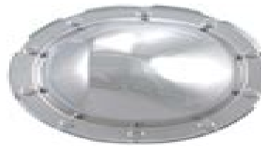
GM 10 Bolt