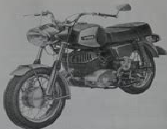
Fig. 14. TH 248cc Scout