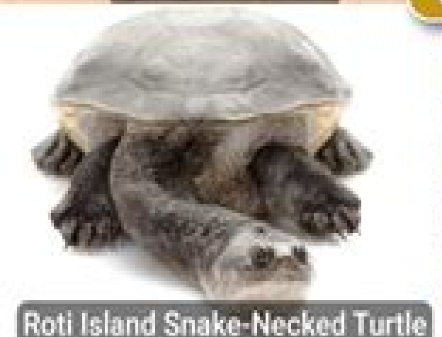
Roti Island Snake-Necked Turtle