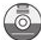
☐ CD-ROM (Owner's Manual)