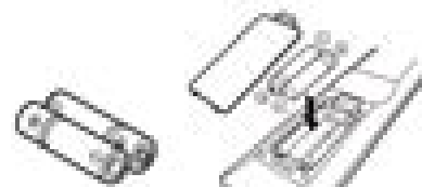
☐ Batteries (AAA, R03, UM-4) x 2

Insert the batteries into the battery case in correct directions (+ and -).