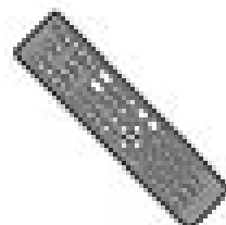
☐ Remote control

Check that the following accessories are supplied with the unit.