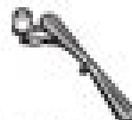
☐ FM antenna*