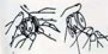
Abertura da fenda

*Puxe a linha para a esquerda, por baixo da mola de tensão, até que entre na abertura de saída.