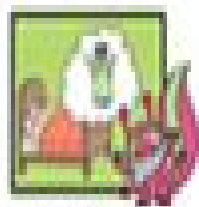
Helping out the Street Cleaner