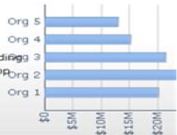
No Year Funding by Organization No Year Funding

No Year Funding Annual Appropriation Rollover