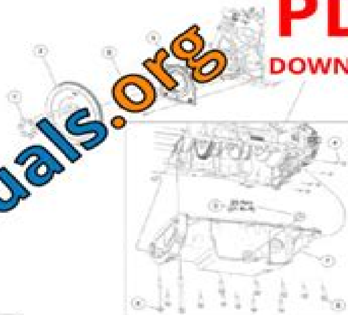
Fig. 46: Exploded View Of Drive, Flashed & Crankshaft Rear Seal With Torque Specifications Courtesy of FORD MOTOR CO.