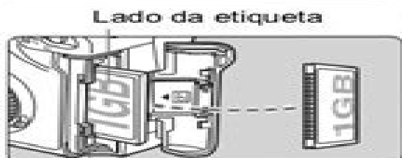
Lado da etiqueta