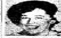
Portrait of a woman, likely a news subject.