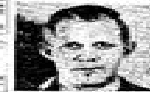
Portrait of a man, likely a news subject.

The search is continuing. The navy is working hard to find the plane. The search is expected to continue for some time.