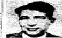
Portrait of a man, likely a news subject.