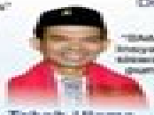
Tokoh Ulama Ustad. Abdul Somad

"SMA N 2 Sumbar satu-satunya sekolah yg saya temui menerima anak didik secara egal menginspirasi saya grufikan tahun lalu ketika di antarakan oleh orang tua saya pergi mengaji ke surau. Disarankan kepada guru secara egal"