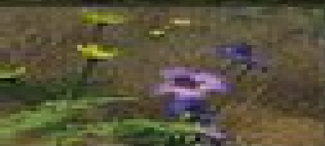
1. Identify the main topic of the text.