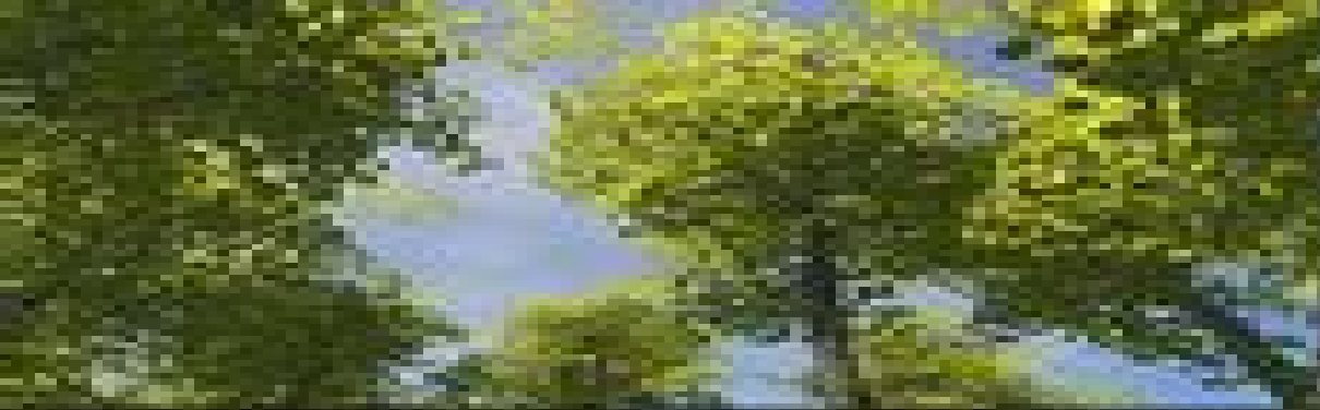
Abstract: Staphylococcus aureus is a common cause of urinary tract infections (UTIs) and is often associated with antibiotic resistance. The aim of this study was to determine the prevalence of S. aureus in UTIs and to identify the factors associated with antibiotic resistance.