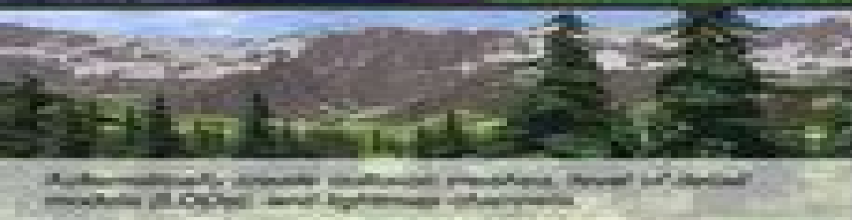
Author contributions: All authors contributed equally and significantly to writing this paper. All authors read and approved the final manuscript.