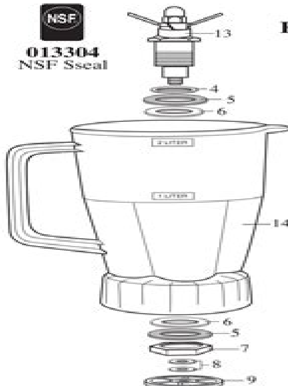
503120 - Blending Assy. Kit 502370 - Blending Assy. (older units)