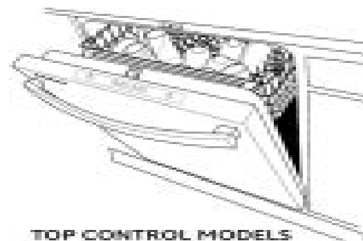
TOP CONTROL MODELS

Write the model and serial numbers here: