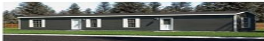
Renderings may differ from floor plans