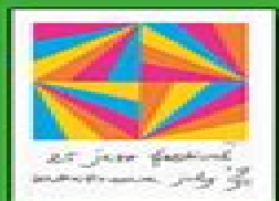
25 jaar festival (1997)