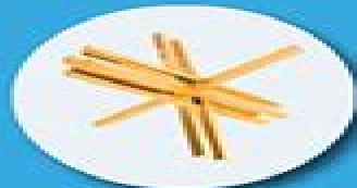
Kern aus absperrungen (1965)