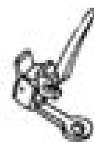
Stitching Foot (extra) (optional)