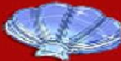
1 Sea Stone