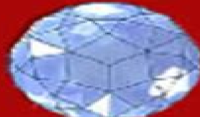
2 Aqua Orb