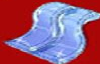
1 River Ripple