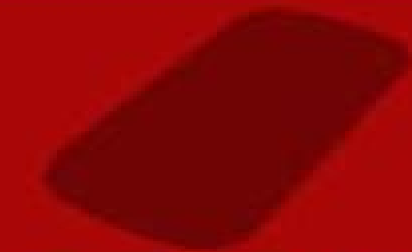
0 Ocean Sapphire