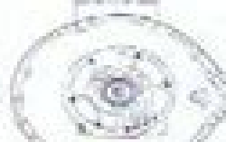
Chrysler TH-727, 341, 383, 400, 474, 440