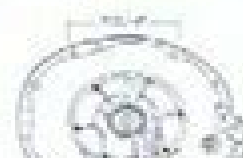
Chrysler TH-727 & 904, 373, 374, 340, 360