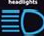
Main beam headlights