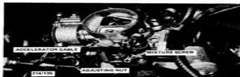
Installed view of carburettor showing accelerator cable adjusting point.

(6) Unplug the electrical wire for the automatic choke at its connector. Unplug the idle stop solenoid wire at its connector. On manual transmission models disconnect the coasting richer solenoid wire at its connector.