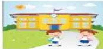
go to school