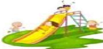
play in the park