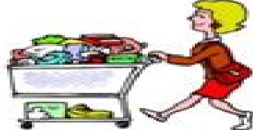
do the shopping