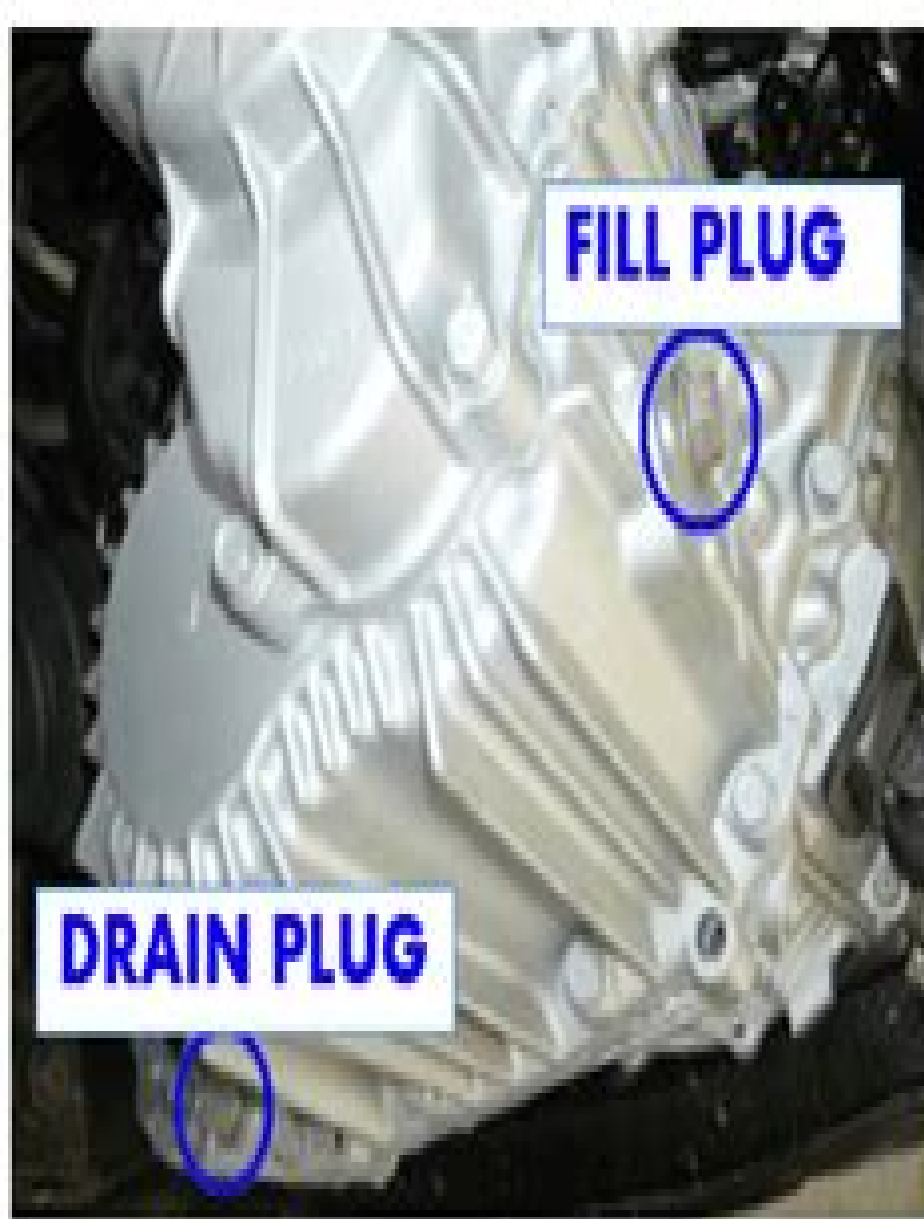
FWD MANUAL TRANSMISSION VEHICLE