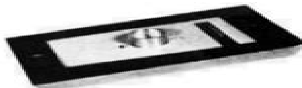
ADF 141 ANTENNA