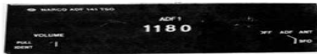
ADF 141 RECEIVER