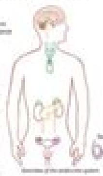
Diagram of the human endocrine system showing the location of major glands.