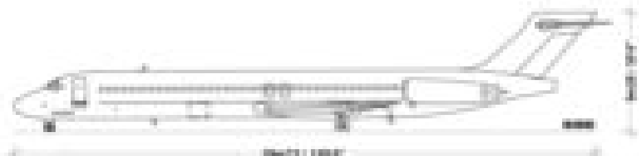
McDonnell Douglas MD87