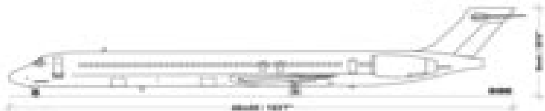
McDonnell Douglas MD90