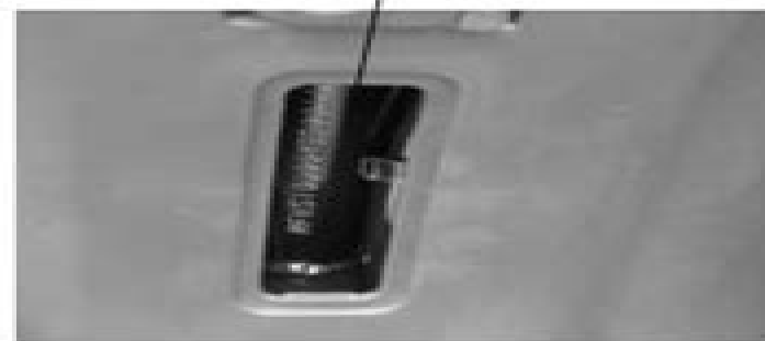
Location of Frame Serial Number