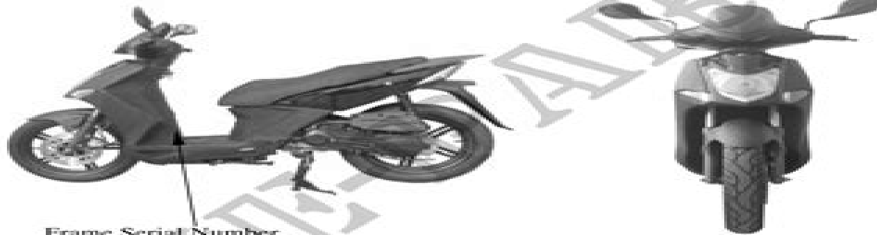
Frame Serial Number