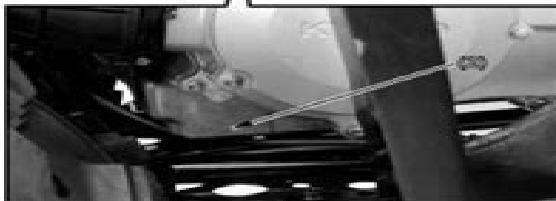
(2) Location of Engine Serial Number