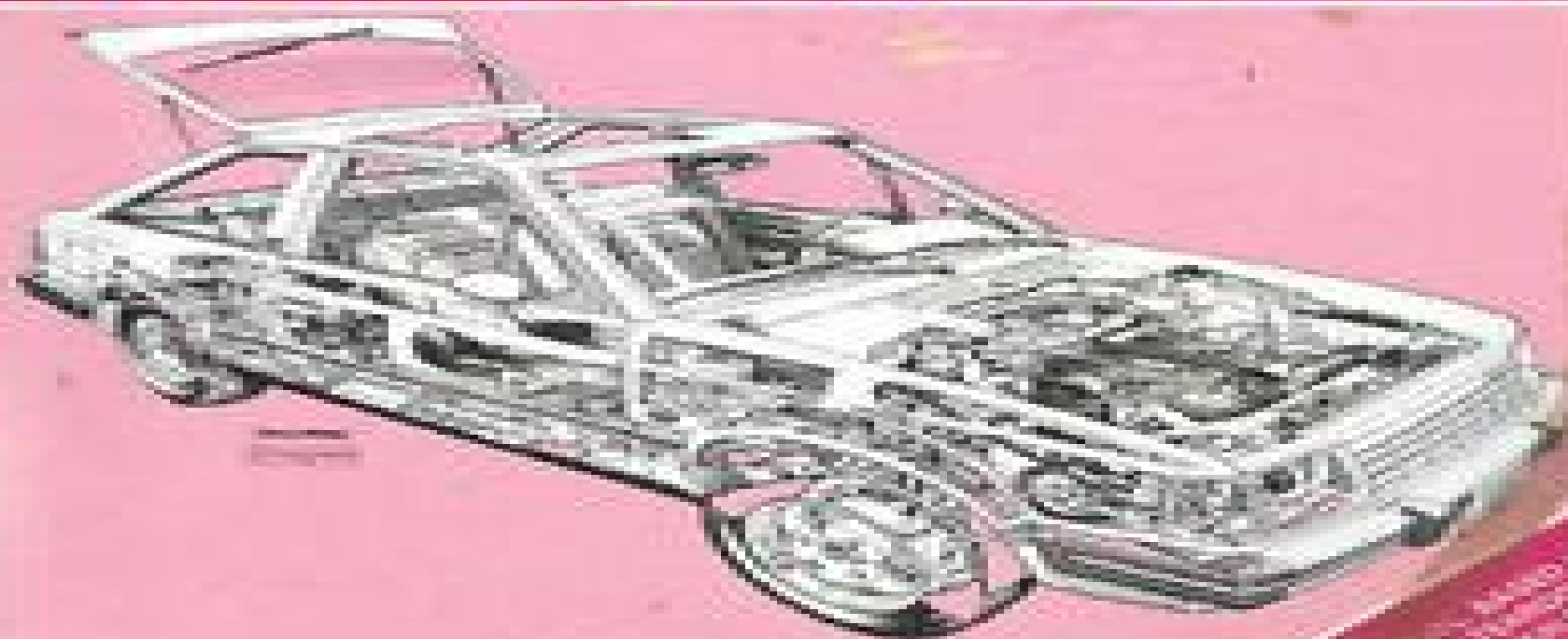
Illustration of the car's chassis and engine components, showing the front engine, transmission, and rear axle assembly.