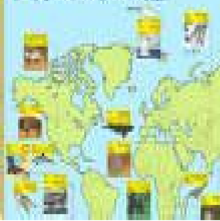
Endangered Animal: Wall Frog