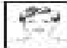
Portrait of a man