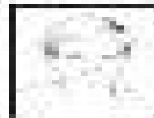
Portrait of a man