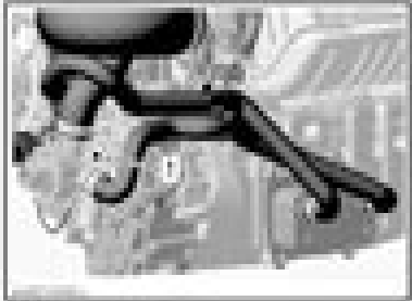
FIGURE 1 1. Water pump housing