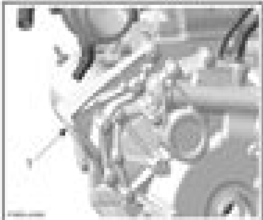
FIGURE 1 1. Engine support