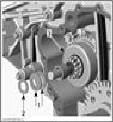
FIGURE 1 1. Disc springs 2. Thrust washer 3. Starter drive

NOTE: Be careful not to loose the disc springs and thrust washer located on the starter drive shaft.